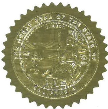
EDMUND G. BROWN JR. Governor of California

IN WITNESS WHEREOF I have hereunto set my hand and caused the Great Seal of the State of California to be affixed this 24th day of December, 2015.