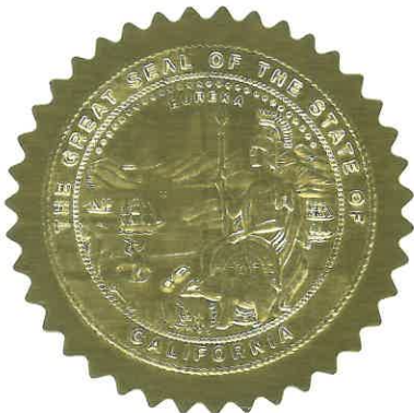
EDMUND G. BROWN JR. Governor of California

IN WITNESS WHEREOF I have hereunto set my hand and caused the Great Seal of the State of California to be affixed this 24th day of December, 2015.