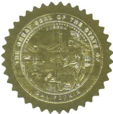
EDMUND G. BROWN JR. Governor of California

IN WITNESS WHEREOF I have hereunto set my hand and caused the Great Seal of the State of California to be affixed this 24th day of December, 2015.